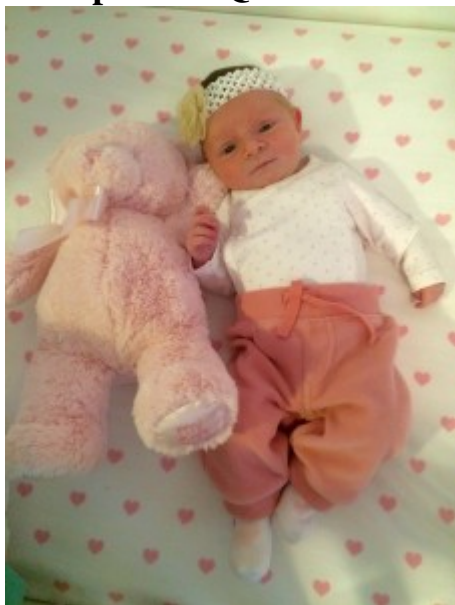
Big eyes and a smile